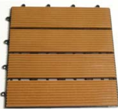
Top of tile

The interlocking mechanism of Shantex Decking Tiles means that it can be laid over virtually any leveled surface making it a “floating” deck. And since the tiles interlock, they are not screwed, nailed, or glued to the surface in any way, thus not damaging the surface underneath. In addition, since it is a “floating” deck and not a permanent one, it is very easy to take with you one day if you decide to move. A unique plastic grid base allows water drainage under the tiles. The open structure of the plastic base allows for good air